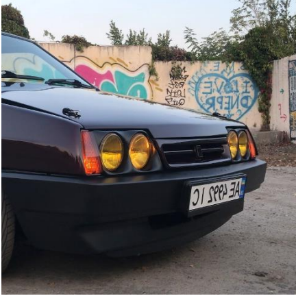
YouTube or Instagram (clickable)