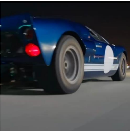
YouTube or Instagram (clickable)