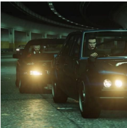
YouTube or Instagram (clickable)